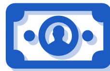
Lost wages or lost support

Family members may be eligible to apply for compensation depending on state regulations and the nature of the crime. Please contact your local Child Advocacy Center for information on your state's specific Victims' Compensation eligibility standards. More information is available at www.ovc.gov .