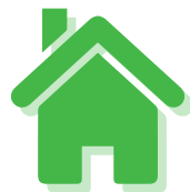
Loss of essential personal property