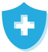
Medical, dental and pharmacy expenses

Each state has a Victims' Compensation program to assist victims and their families with financial costs associated with a crime. Child Advocacy Centers and other victim-serving agencies are a useful resource to assist families in applying for Victims' Compensation. In some states, the application may be available online. Although it varies by state, some of the expenses that qualify for compensation may include: